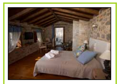
Junior Suite Loft Room 404 ( 2nd floor ) Double bed. Jacuzzi bath. Balcony

Superior Sea View Rooms 307 and 308 (1st floor) Double bed. Shower. Shared terrace with private sittings.