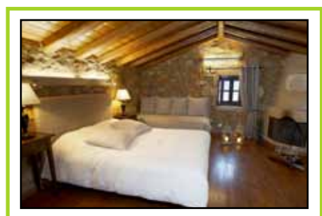
Superior Courtyard Room 402 (2nd floor - steep steps) 1 double and 1 single. Jacuzzi bath.