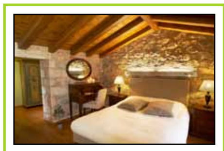
Superior Courtyard ♥ Room 403 (2nd floor - steep steps) 2 double beds (one small double bed in loft up steep ladder) and 1 single. Jacuzzi bath.

Classic Premier Room 201 (ground floor) 1 double and 2 single beds. Bath with shower over. Larger than classic double.